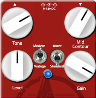
Ain't talking 'bout...