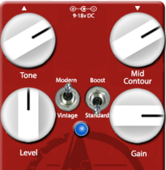
It's one mean street...